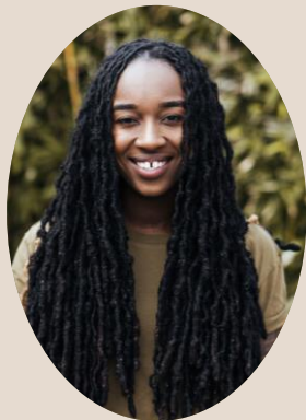
JACKIE HILL PERRY Poet, Author of “Gay Girl, Good God”