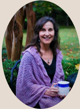
ROSARIO BUTTERFIELD Author of “The Secret Thoughts of An Unlikely Convert”